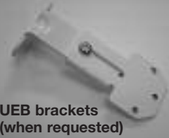
UEB brackets (when requested) 1 per 50cm